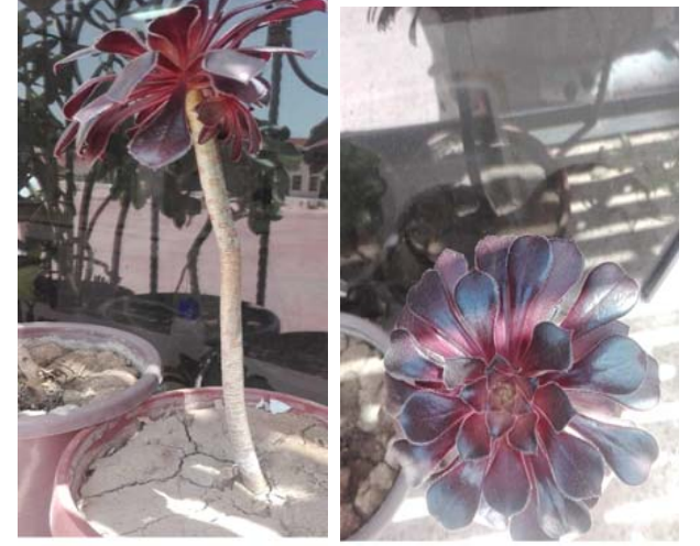
Taearset n ufedluḥ