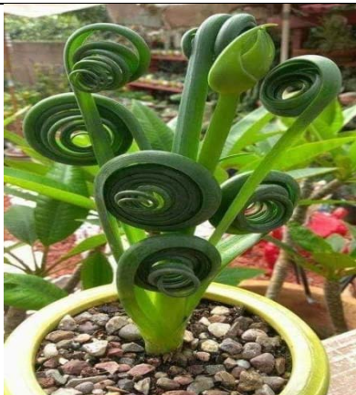
Ajeylal n uëarus