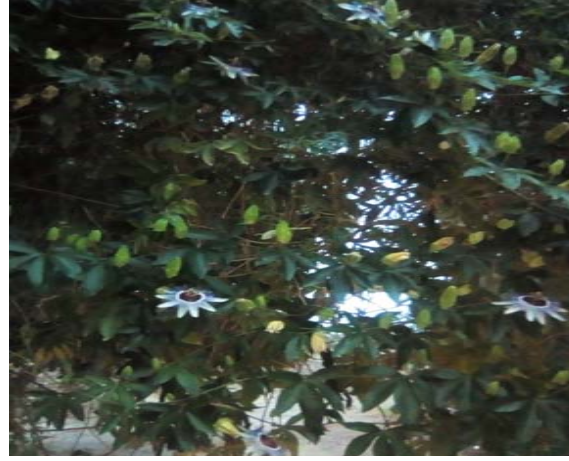
Ucbih n şbah