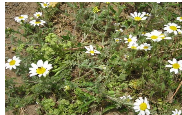
Wajdim (ajeğğig-is :wamlal)