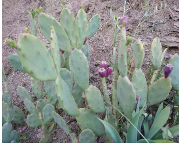
Akermus n urumi