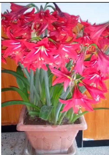
Buəenqiq n tfenjalın