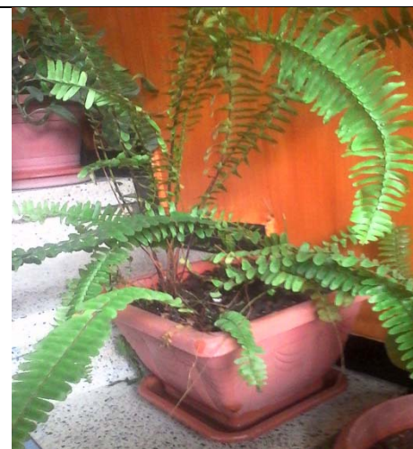
Erric n uyazıd