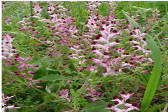
Tijujar n yisyi