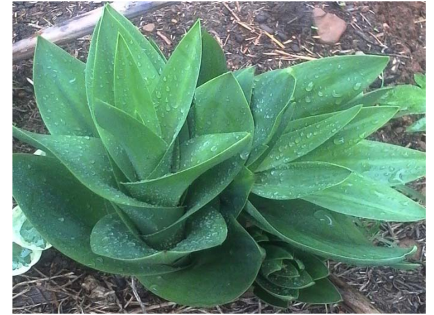
Tibşelt n yekfil