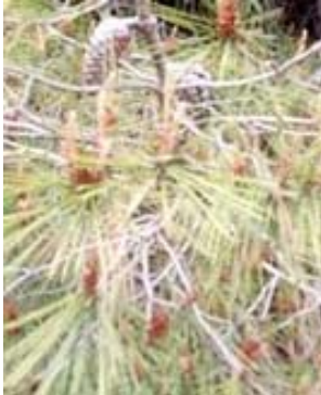
Izumbiyen n tayda