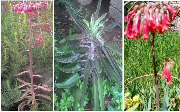
Timqerqert n Şşehra