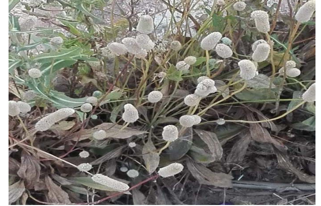
Imeċċi n tyirdemt