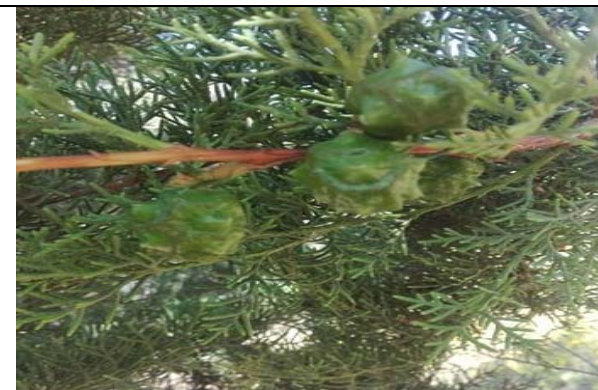
Tiqezbulin n lbesta